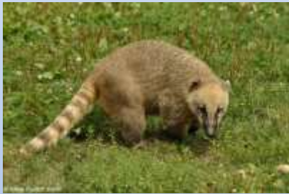
South American coati